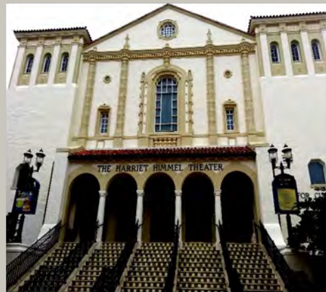
Harriet Himmel Theater