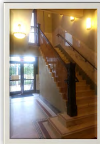
Courthouse Interior Following Restoration