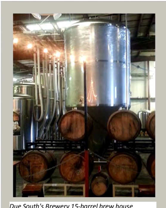
Due South's Brewery 15-barrel brew house

Each of the tours and receptions offered their participants the opportunity to experience different aspects of West Palm Beach on an intimate and personal level. The venues and information enforced the planning theories and practices that were discussed at the conference, providing attendees with valuable, and enjoyable, firsthand understanding of this rich and complex urban area.