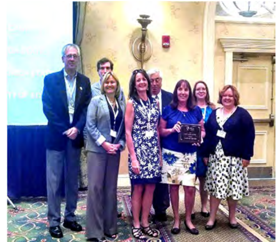
The chapter accepting the 'Outstanding Chapter of the Year' award at the 2014 conference.