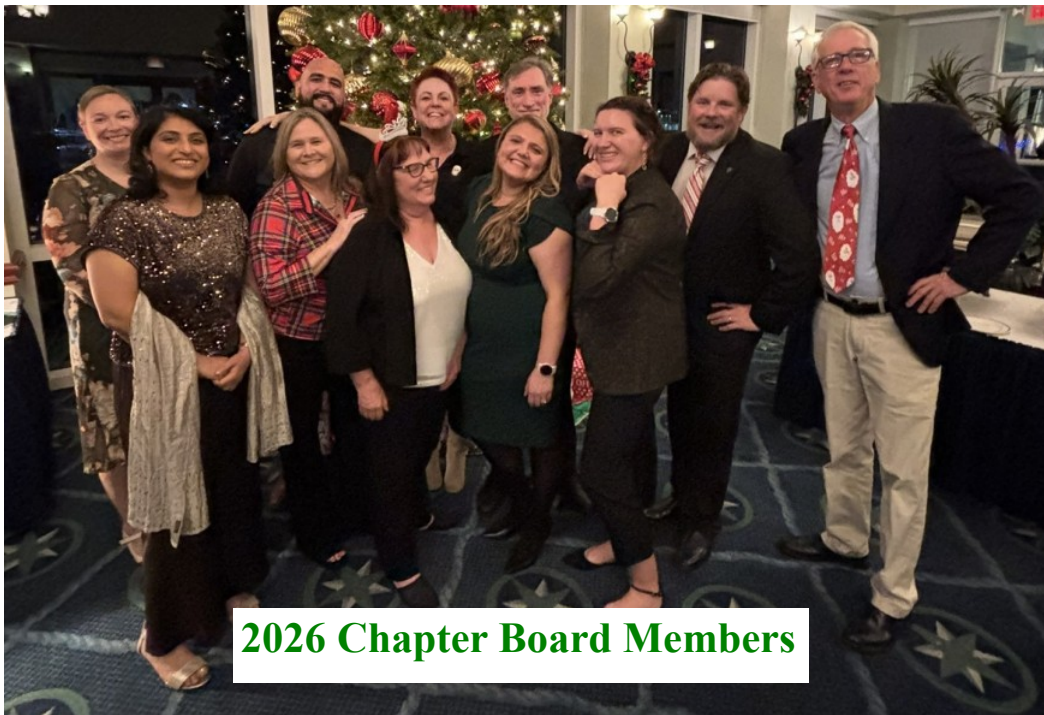
2026 Chapter Board Members