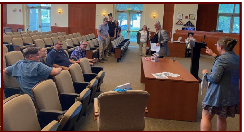
The Contestants battling it out!