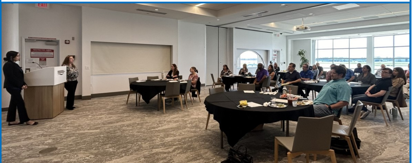
Presenters and Attendees in the Dennis McGee Room at the Daytona Beach Airport